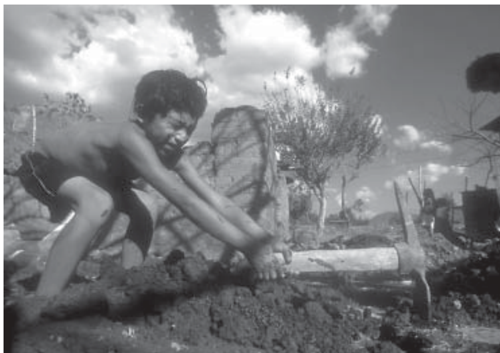
Ahuachapan boy helps reconstruct his home after 2001 earthquake in El Salvador.

In November 2001, the General Secretary received a request from the IELC for increased LWF support of their work with