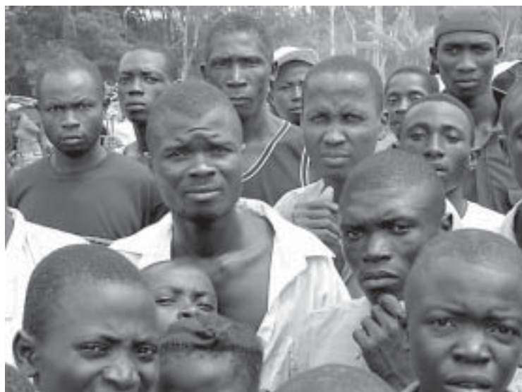
Many IDPs in Liberia lose contact with family members after fleeing war zones.

Nation-states’ increasing disregard for their international obligations in refugee