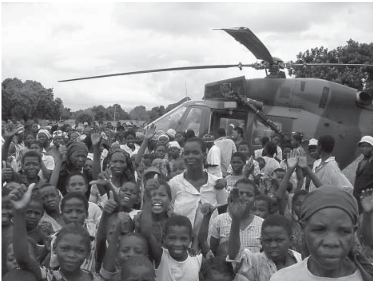
Mozambique's flood victims welcome aid through emergency response, 2000.