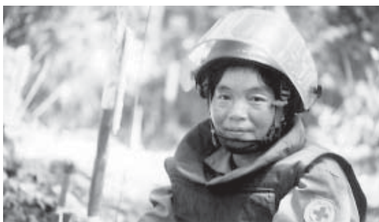
The Cambodia program includes training in de-mining activities.

Since the Ninth Assembly, DWS has increased efforts to protect the natural environment in its projects and to maximize their