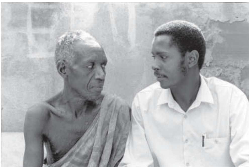
A student volunteer gives counsel in Uganda program for people living with AIDS, Rakai Province.

over two decades ago, over 22 million people around the world have died. This epidemic is reversing development gains, robbing millions of their lives, widening the gap between rich and poor and undermining social and economic security.