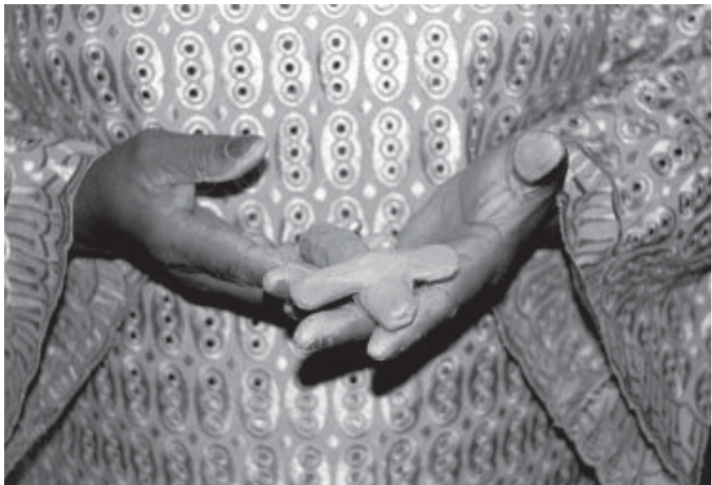
Participant in Global Consultation on Diaconia molds clay into a cross during meditation, Johannesburg, South Africa, November 2002.

The three-year LWF action plan, "Compassion, Conversion, Care: Responding as Churches to the HIV/AIDS Pandemic," was launched in 2002 in response to the urgent