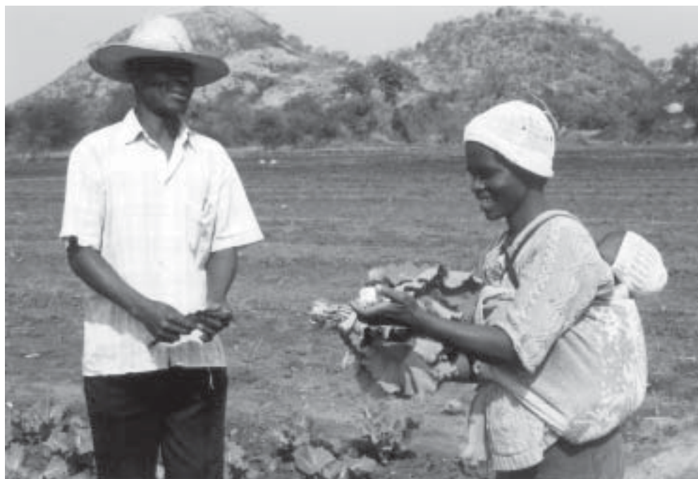
Rural community development project, Zimbabwe.

Since 1995, efforts have been increased to localize LWF operations under a church-related organization, the Lutheran Development Service (LDS). A transitional project designed to prepare LDS to take over was implemented from 1997 to 2000. Between 1997 and 1998, joint regular meetings were held between the LDS