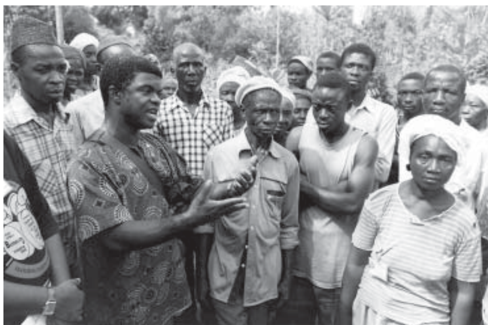
Local villagers gather in Liberia to learn about trauma healing and reconciliation.

In September 1999, a CSO workshop developed a strategic plan for the Liberia Program. Its mission and overall aim were formulated as follows: to empower people to satisfy their basic needs in a sustainable way. It is hoped that this will be achieved by: implementing an integrated rural development program focused on