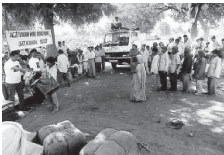
Relief goods are distributed in Gujarat, India, after the 2001 earthquake.

reversed in recent years, with conflict-inspired emergencies increasing dramatically. Normally, emergency response to natural disasters can be fairly short term no more than a year or so. Conflicts, on the other hand, can continue for years and tend to compound and transform crises into complex emergencies. Tragically, the overall number of emergencies has also increased markedly.