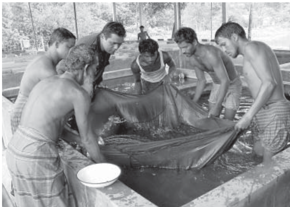
Fingerlings are harvested from fish hatchery in Ulipur, Kurigram District, northwestern Bangladesh.

development aid. The development program focuses on the pursuit of primary group formation/graduation and the emergence of apex bodies known as Union Federations. Higher priority has been assigned to sustainable economic livelihoods, but RDRS has also been active in promoting the rights of the rural landless,