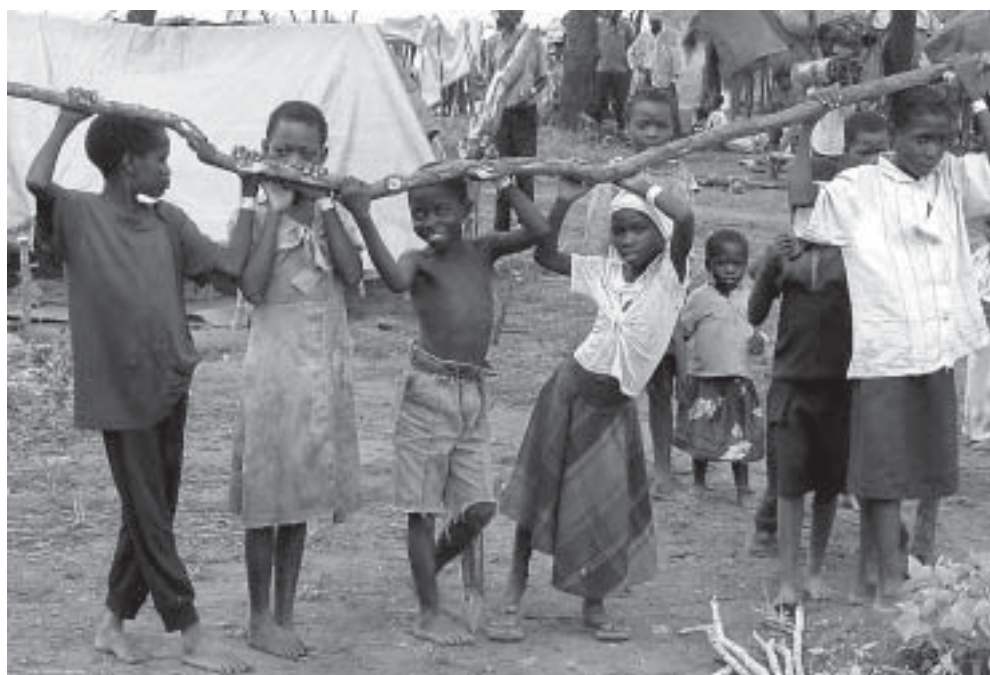
Children at a refugee camp in Zambia

For several years Zambia has experienced an influx of refugees and an increase in socioeconomic problems that have posed a serious dilemma. These difficulties have been further exacerbated by the HIV/AIDS