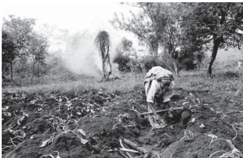
Rwanda: Woman tends vegetable garden in food security project.

By 1998, given the growing ability of the Rwandan population to resume earning their daily livelihood, the question of