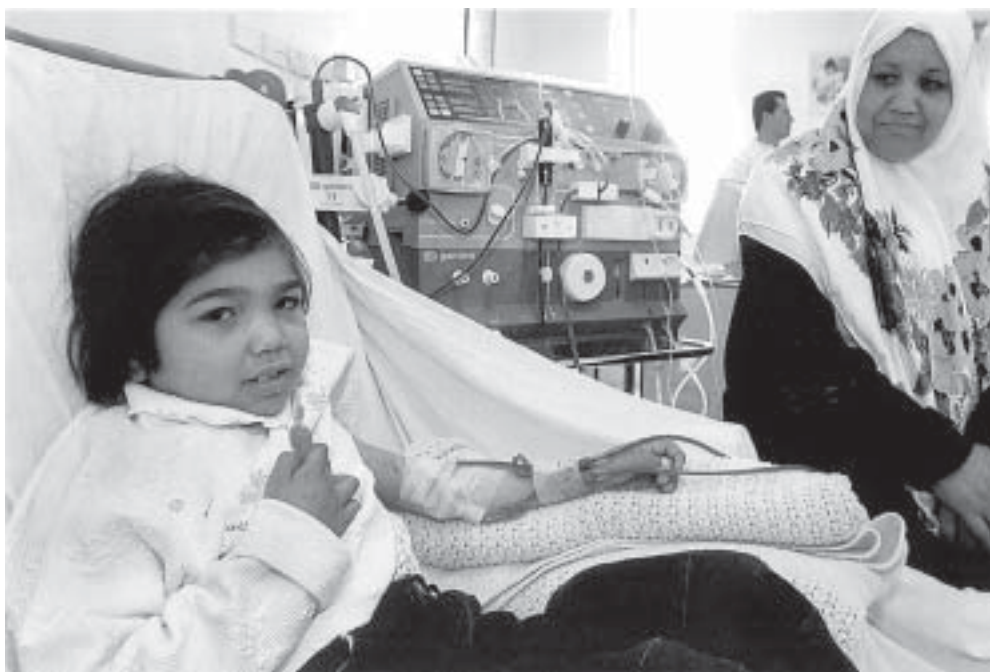
Young girl receives dialysis treatment at the Augusta Victoria Hospital, East Jerusalem.

In the past few years VTC has undergone significant changes. It hired its first woman director and recruited two female