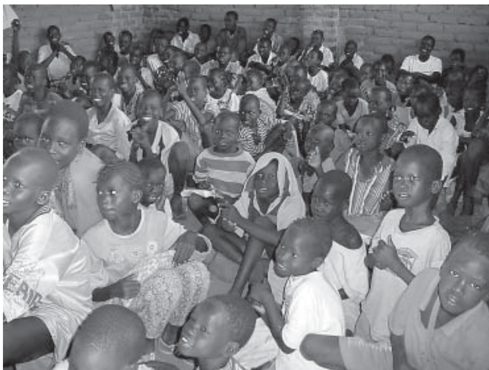
Pupils in a classroom at the Kakuma Refugee Camp, northern Kenya.

ing the government of Kenya to declare an emergency and to call for international food aid. DWS became part of a coordinated approach to deliver food aid to three divisions within Turkana district, reaching some 80,000 people in 42 locations.