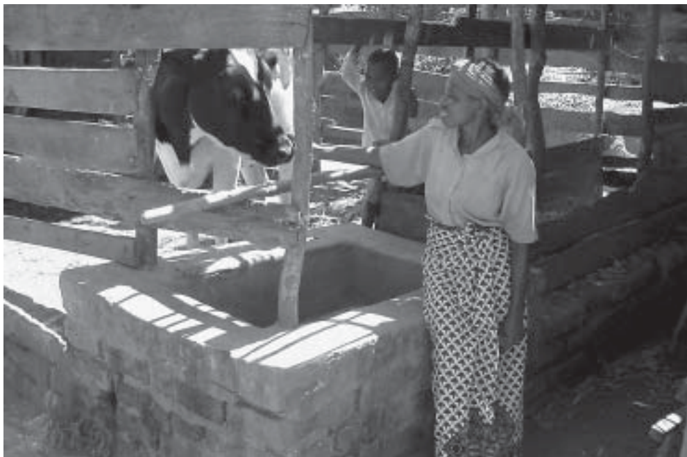
This Pare woman from Same District in northeastern Tanzania received a pregnant dairy cow from the Same Rehabilitation Project, operated by LWF/DWS Tanzania. In return, she gave the first female calf to another family, which then gave its first calf to another family, and so on. In this way, for many families, a one-cow donation turns into better nutrition and extra income from the sale of milk.