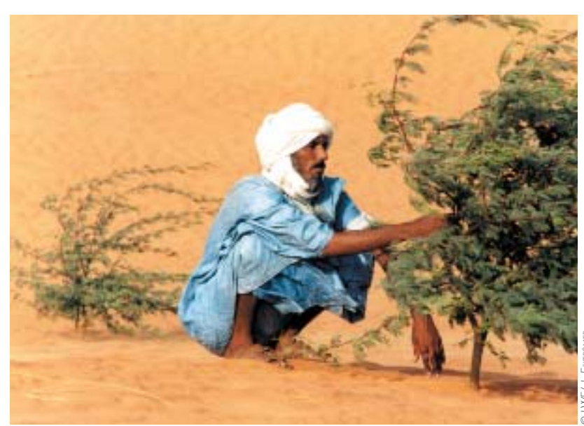
Mauritania: Dune-fixation and reafforestation

Human beings have spoiled or destroyed much of God's creation. How can creation be restored and our relationships with the rest of nature healed? How is this related to sacramental understandings? What can other traditions teach us? What are the power and the responsibility of human creativity in relation to the rest of nature, including through the use of technology? How far should efforts go to heal or improve human life? At what risk? What is at stake theologically?