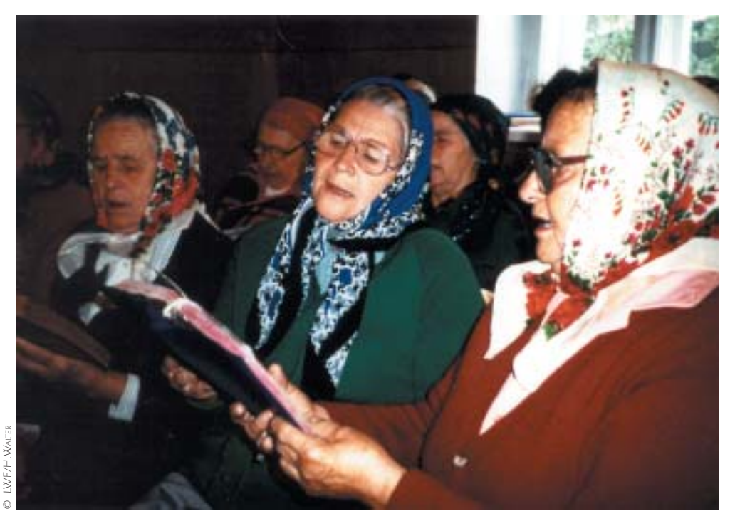
Russian Federation: Congregation in Kant

Village Groups will be a central feature of the Assembly. They are the settings where Bible study discussions will occur, and where important implications of the Assembly theme will be pursued. More will be written on each of the topics in the Assembly Study Book. Work in the Village Groups will develop the substance of the Assembly Message and commitments. Assembly participants will be asked to indicate their Village Group choices when they register.