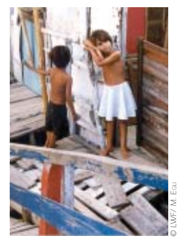
Brazil: In the 'favelas' around Recife

The mission of the church points to and participates in the coming of God's reign. How can every Christian and every congregation be empowered to participate faithfully and effectively in this mission? Rec-