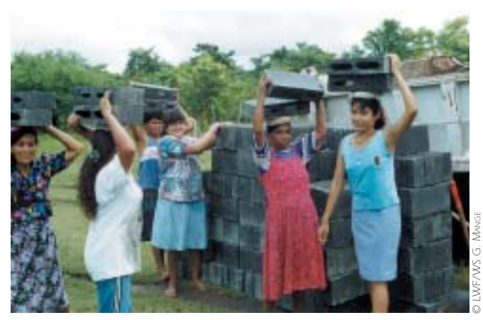
El Salvador: Reconstruction program after hurricane Mitch.

This theme suggests the need to give greater attention to the role of the Spirit, in a triune understanding of who God is and how God relates to the world. Through God's Spirit we participate in the divine pathos,